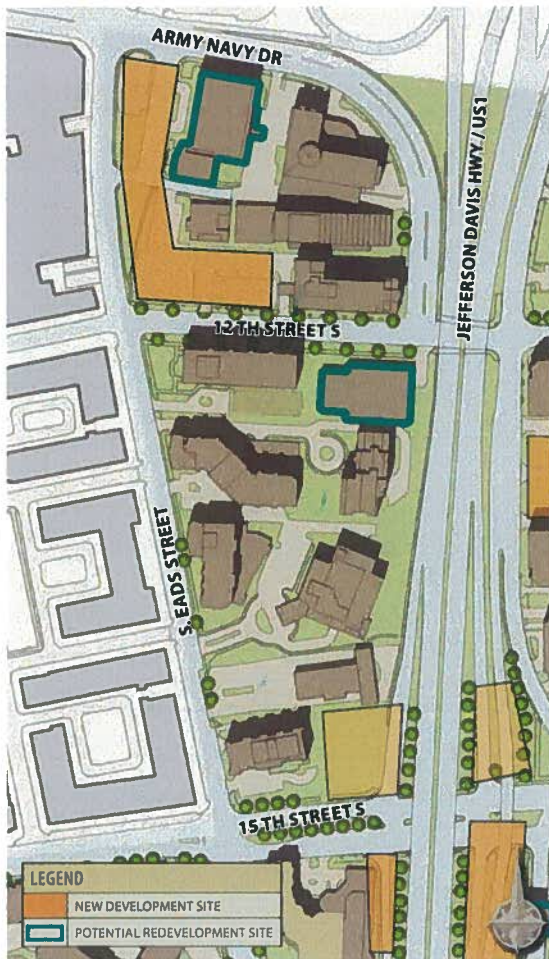
Existing Conditions - Figure 3.3.15