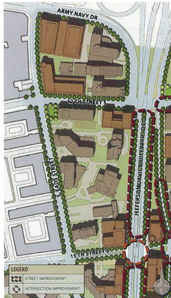
Proposed Plan - Figure 3.3.16